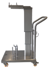
Special carts Stainless steel tanks