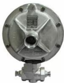
Pressure Reducing Valves Pharma and Biotech

Did you know that it is now possible to configure Steriflow valves to your specific needs? Just fill in some technical data on the use of the valve and it will be adapted to your application/process.