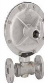
Pressure Reducing Valves General SS Applications