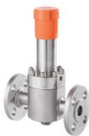
Pressure Reducing Valves Food and Beverage